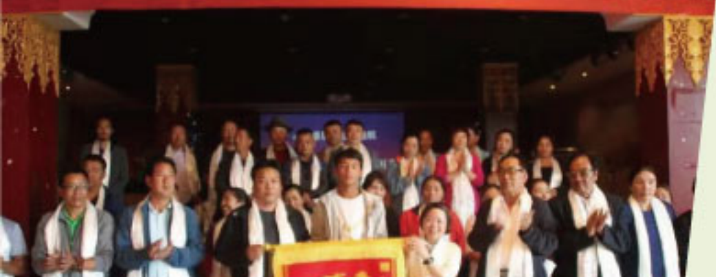
「2019高三孩子感恩典禮暨高考表彰大會」。 Senior Three Students' Appreciation and College Entrance Exam Commendation Assembly 2019.